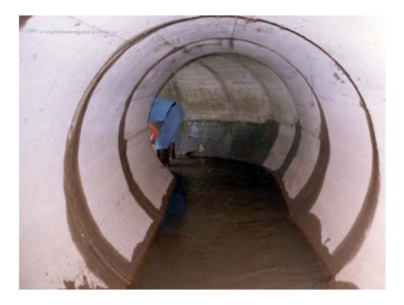
FIGURE 2: Typical Joint Infiltration in Non-Gasketed Storm Sewer