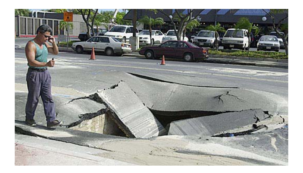
<FIGURE 1: Structural Failure From Loss of Fines>

Some municipalities are addressing these structural and liability issues by requiring watertight connections or no infiltration into the pipeline. The Ohio Department of Transportation has recently issued "Supplemental Specification 802," which requires independent third party inspection of all storm sewer projects for joint integrity and infiltration. If either is found to be a problem, detailed repair and replacement requirements are stipulated prior to the acceptance of the pipeline and payment of the contractor.