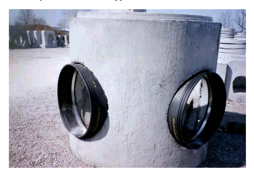
<FIGURE 4: Typical Pipe-to-Structure Boot Connection>

Watertight connections take two forms: rubber gasketed pipe connectors and rubber pipeto-structure booted-gasketed connectors. The key word with both of these connectors is rubber. Rubber is a resilient material that is capable of maintaining high pressure seals and will permit independent movement of pipe-to-pipe and pipe-to-structures without loss of watertight integrity. Rubber gasketed connections are therefore used on all water and sanitary pipe. These rubber products are covered under ASTM standards C 443, C 923, D 3212 and F 477. All other sealing methods used for storm sewers are not watertight. This group includes mastics, mortar, filter fabric, external wraps, collars, coupler bands and any other non-rubber applications.