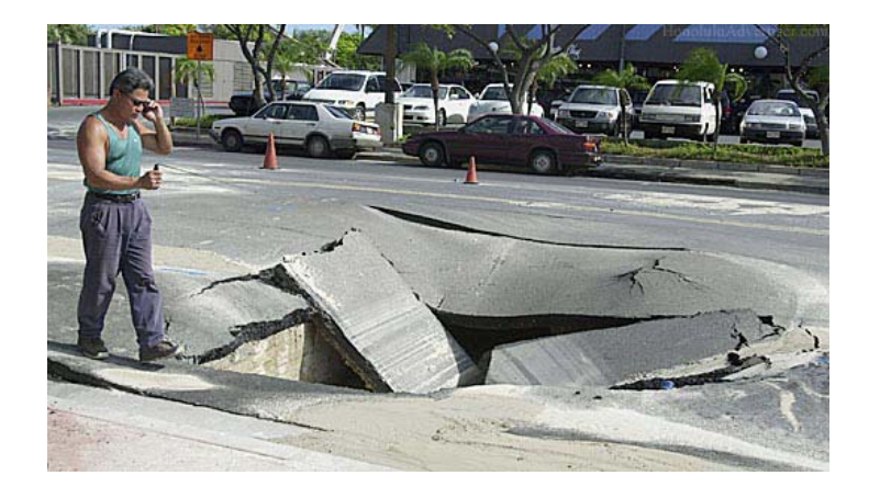
FIGURE 1: Structural Failure From Loss of Fines