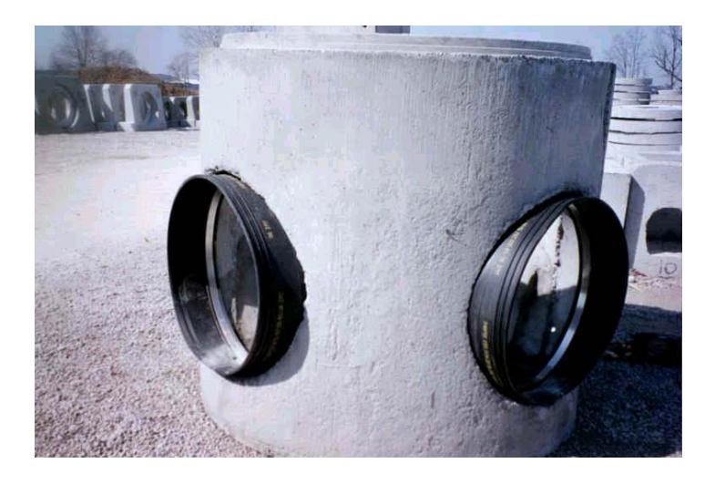
FIGURE 4: Typical Pipe-to-Structure Boot Connection

FIGURE 3: Labor Intensive Field Mortaring of Structure Connection