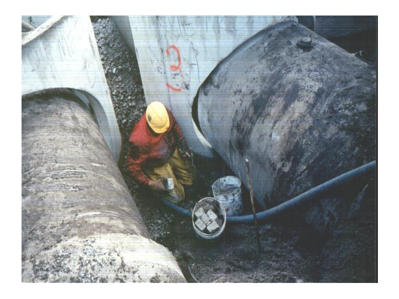
FIGURE 3: Labor Intensive Field Mortaring of Structure Connection